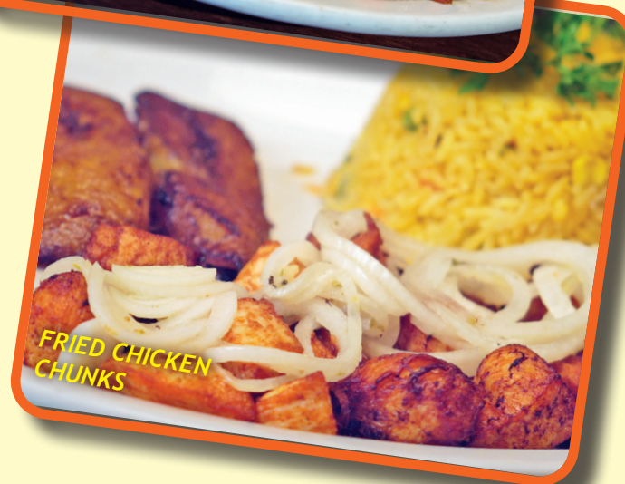
FRIED CHICKEN CHUNKS