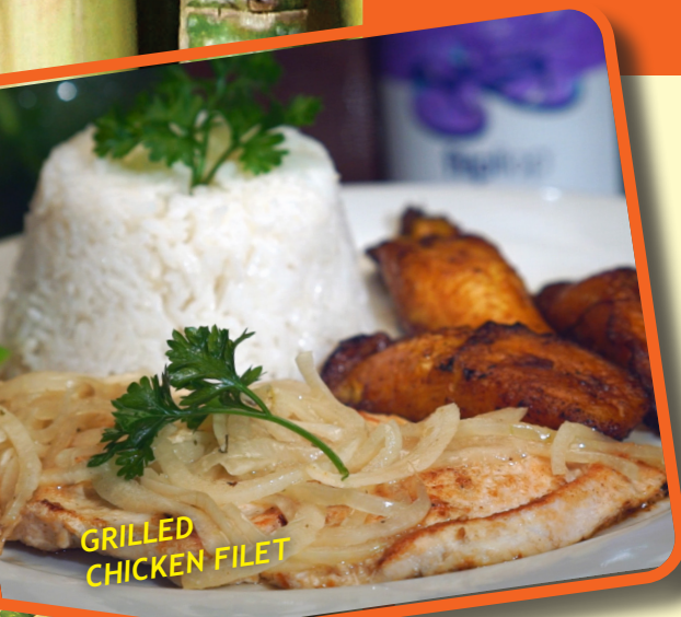
GRILLED CHICKEN FILET

Boneless Chunks of Chicken Breast, Marinated and Fried $16.95